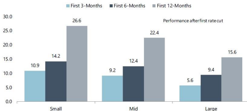
Exhibit 4. Performance after first Fed interest rate cut +

Note: Used Fed Funds from 1954 until 1963, then used the Discount rate from 1963 until 1994 and Fed Funds rate after that.